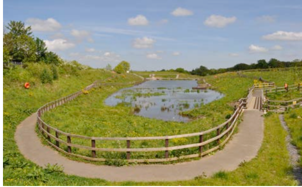
Wydon Burn Reservoir from the west

2. Opposite the farm buildings, a gate on the right gives entry to the bottom corner of a large field. Cross the corner and enter the dene via a stile. The path now bears left and down to Wydon Burn. Just prior to reaching the burn, however, the track branches off to the left. Follow this, usually mucky underfoot, on the same side, until you leave the dene on the upper Causey Road just below Benson's Fell Farm. Go up the hill, steep but short, to the Yarridge Road, passing the caravan park on your right.